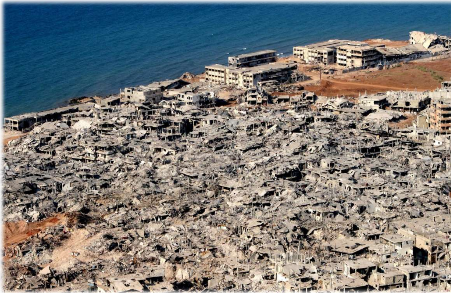
Nahr el-Bared Refugee Camp before reconstruction © AKAA / Courtesy of architect