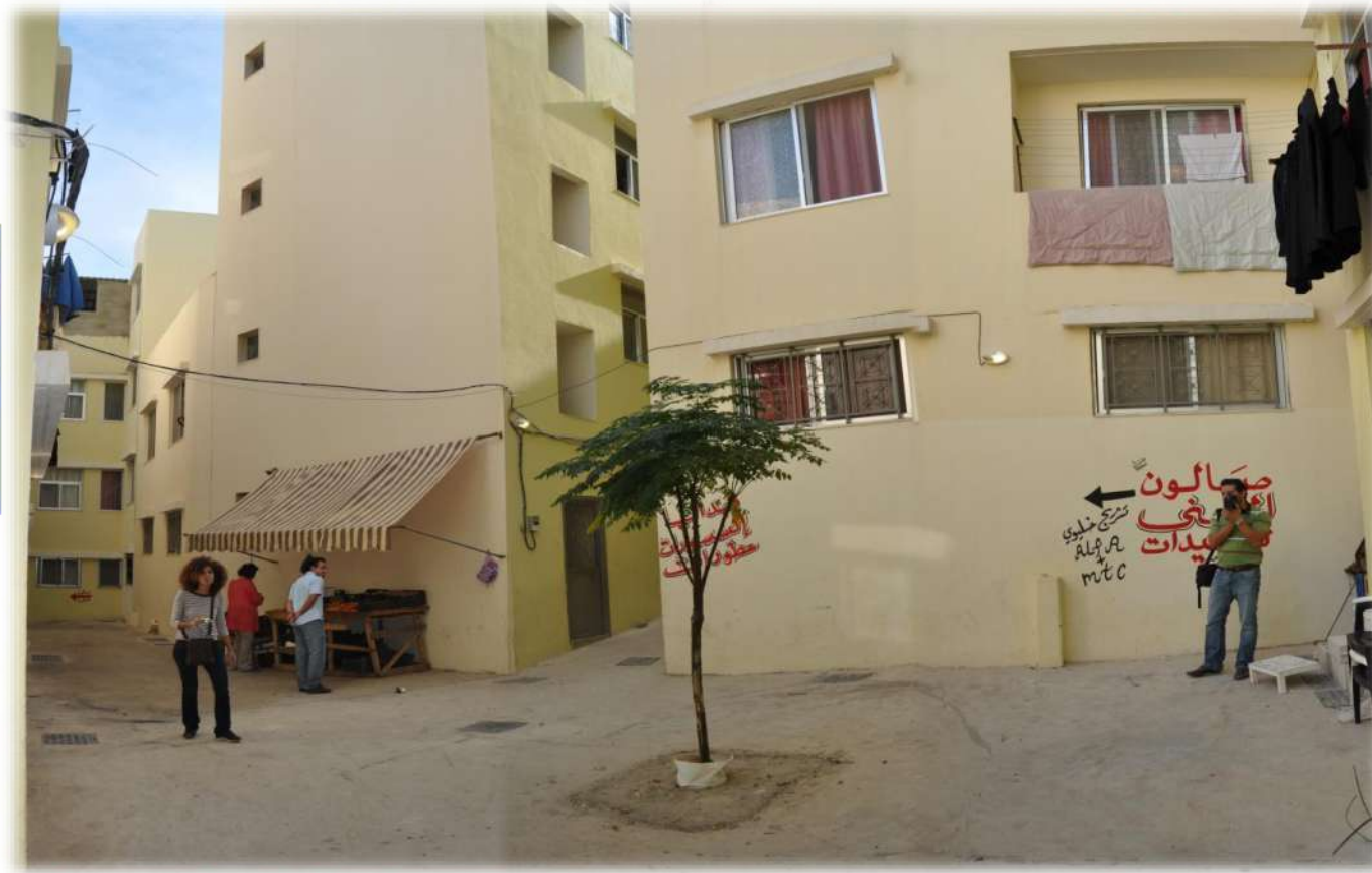
View of a courtyard

Planning for Peace: Localising transitional justice in refugee settlements in the Middle East