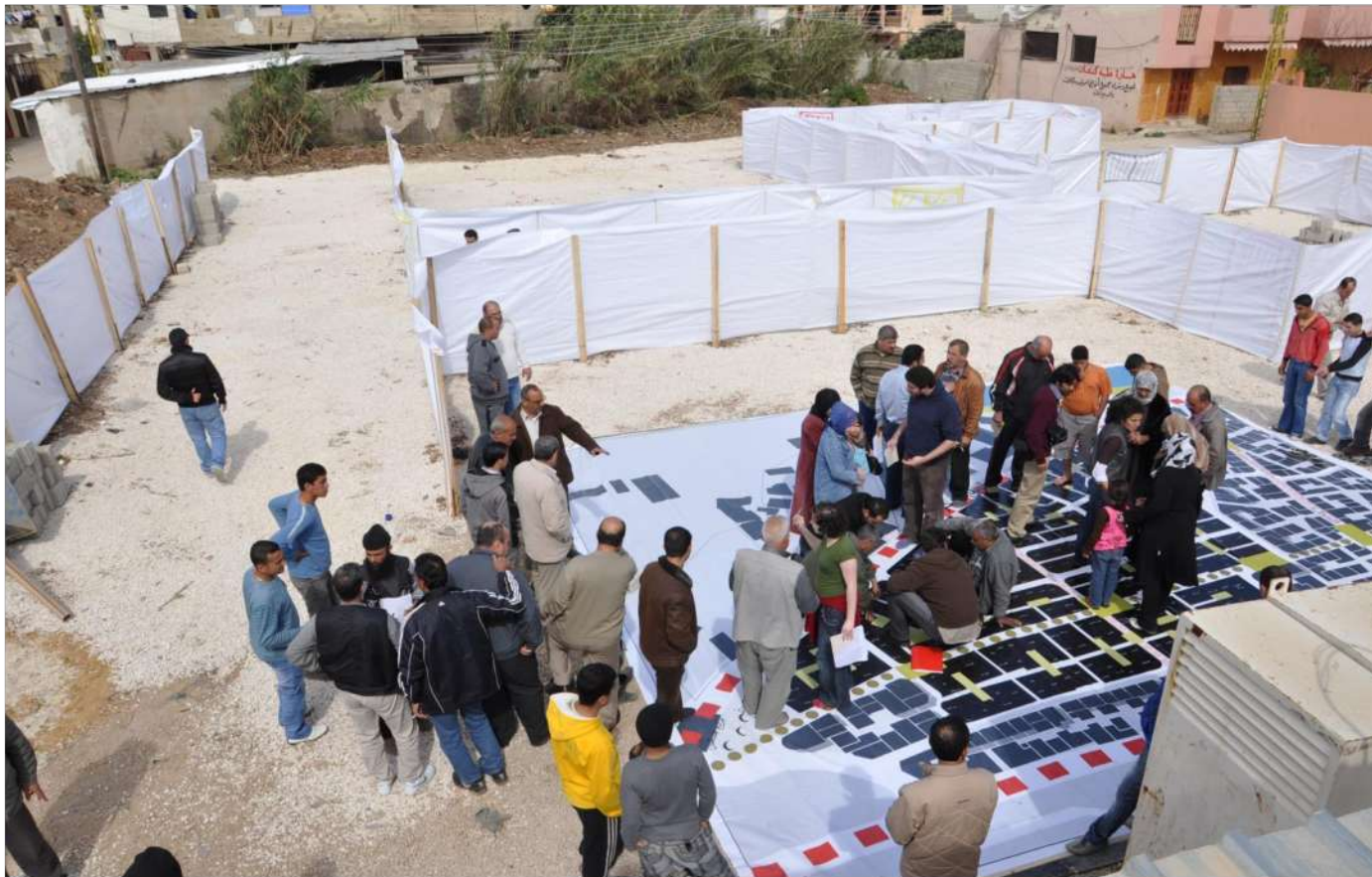
Residents discussing the master plan on a walk-in map