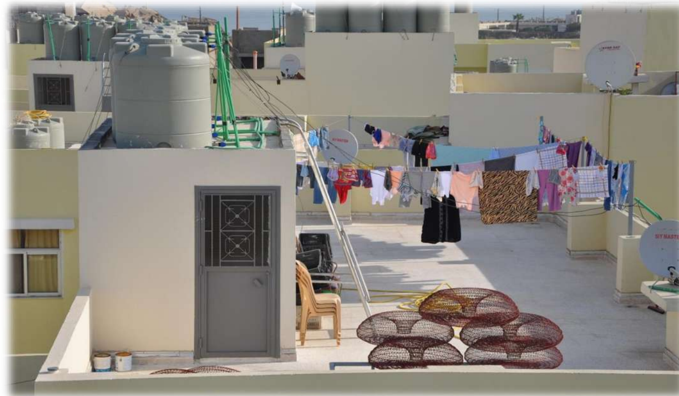
A fisherman House roof

The project bases its foundation on the fact that 'the struggle for rights ... is part of the process of producing space' (Mitchell, 2003, p. 29). Hence, it focuses on the relationship between transitional justice and spatial transformation; the role of refugee communities as a focus of transitional justice; and the fact that 'reclamation of public space is not only for societal order and control, but rather for the struggle for justice' (Mitchell, 2003, p.222). The right to the city in this context revolves around the production of urban space and justice is understood as predicated upon the struggle in (re)claiming the public space. Drawing on the memory, resistance and the everyday spatial practices of refugees in the rebuilding of the camp, the project enhances this argument beyond the sphere of politics or urban planning, framing the refugees' claim to the city instead as a matter of justice and rights.